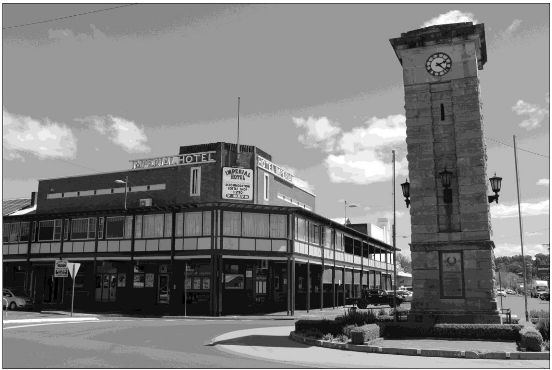
Imperial Hotel and Coonabarabran War Memorial Clock Tower