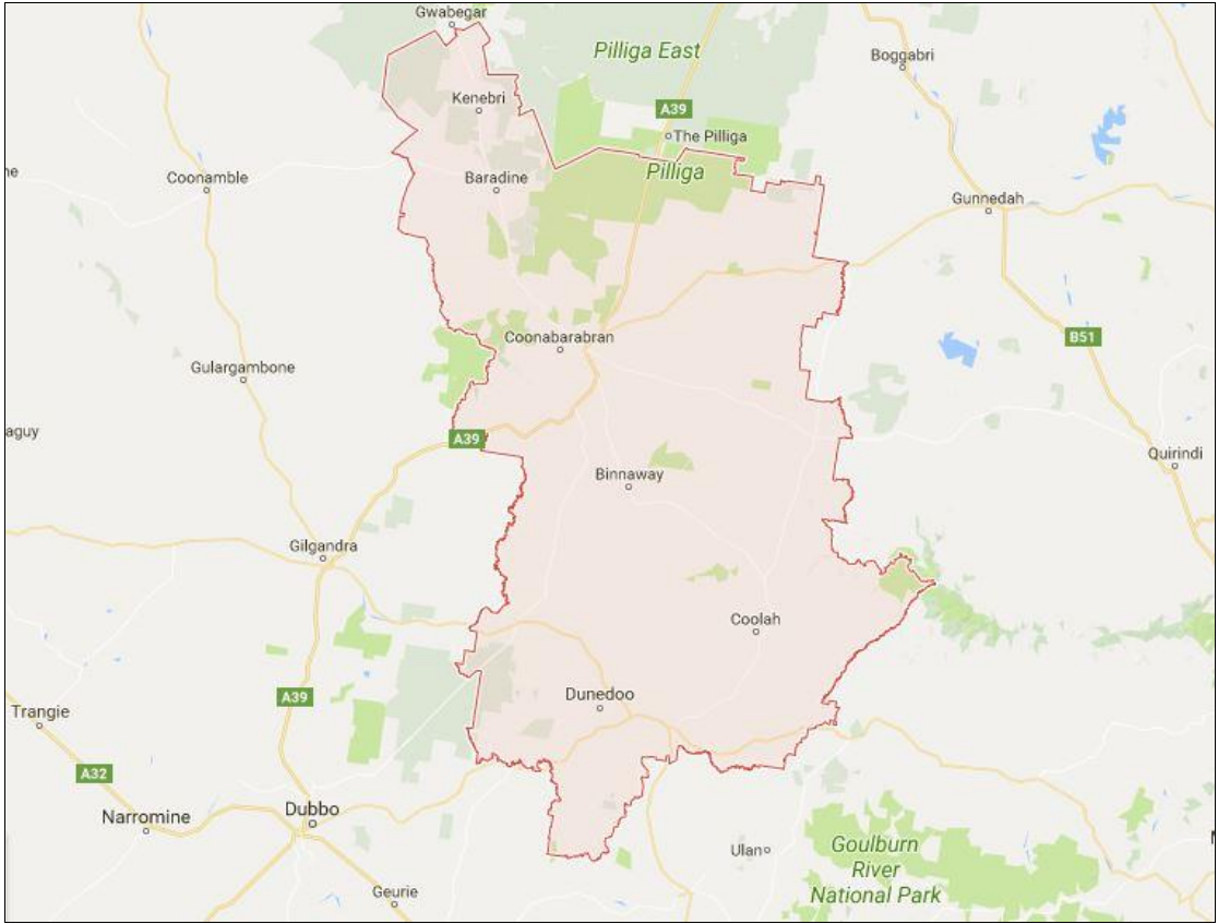
Figure 1: Location Map. The Warrumbungle LGA is outlined and shaded in red.

The Warrumbungle Shire is bound on the west by the Coonamble Shire, on the south west by Dubbo Regional Council, on the south by the Mid-Western Regional Council, on the east by the Upper Hunter, Liverpool Plains and Gunnedah Councils, and on the north by Narrabri Shire Council.